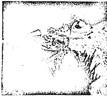
Fig. 3. Spiny lobster ( Panulirus argus ) bearing a sonic pinger.

The dive also permitted study of the processes in still water that orient empty pelecypod valves with their concave surfaces up or down on the sea floor. Examination of more than 2300 shells lying on diverse substrata demonstrated that, as in deeper water on the continental shelf (7), shells lie predominantly with their concave surfaces up, in contrast to the predominant configuration of downward concave surfaces produced by waves and currents. Moreover, the tendency toward concave-up configuration in still water increases with increasing shell size; under the influence of waves, this tendency is reversed: the larger shells show the greater degree of concave-down configuration. Predators of the pelecypods, attendant scavengers, and bioturbation probably produce this predominantly concave-up configuration (7). To determine the effect of bioturbation on shell configuration, 400 matched, cleaned valves of different sizes were emplaced on the sea floor, half with the concave surface up and half with the concave surface down. Bottom-dwelling organisms overturned shells of all sizes in both sets but, during the 2-week period of the experiment, a greater number of larger shells were rotated to the concave-up position.