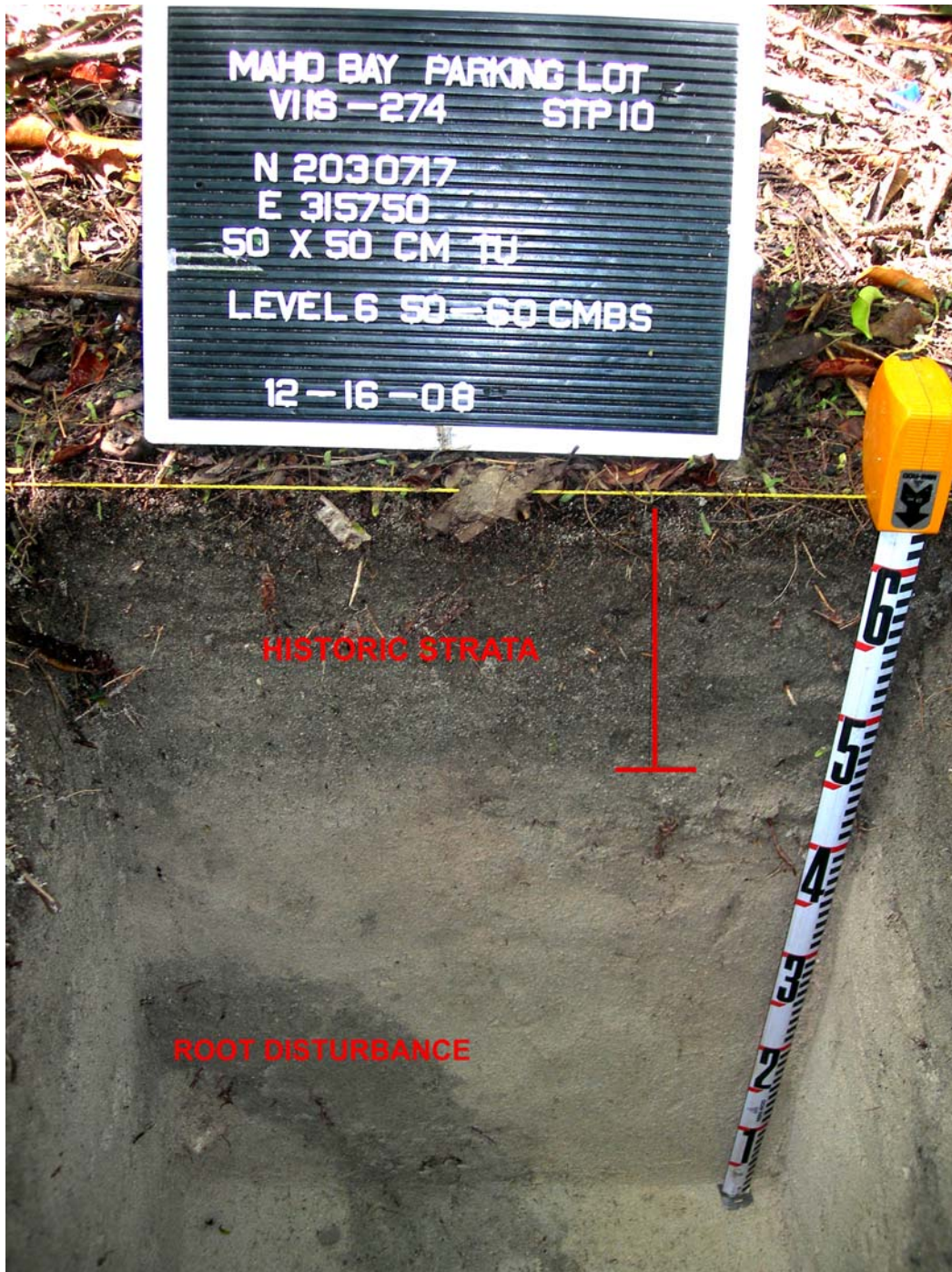
Figure 7. Photograph of the North wall of STP 10 showing typical site stratigraphy.