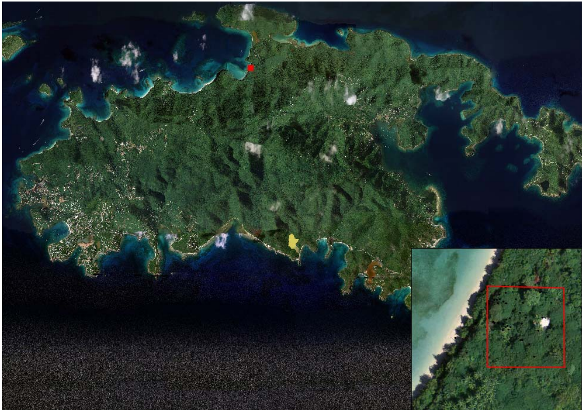
Figure 1. Aerial of St. John and the project area at Great Maho Bay.

Archeological investigations were conducted at Maho Bay for a proposed parking lot between 27 June 2008 and 5 August 2008. Additional testing at this site was carried out between 2 December and 19 th December 2008. A gravel parking lot will be established in order to prevent parking along the beach side of the street. This will eliminate vegetation removal and stop the beach erosion process at Great Maho Bay. Figure 1 depicts a map of St. John and the project area at Maho Bay.