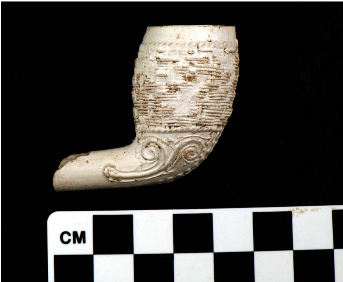
Figure 4. Molded, decorated 19 th century pipe bowl recovered from STP 3 by volunteer Kelsi Lindquist .

larger holes, while the bore diameters in later pipes are much smaller. Figure 4 depicts the molded, basket decorated pipe bowl recovered from STP 3.