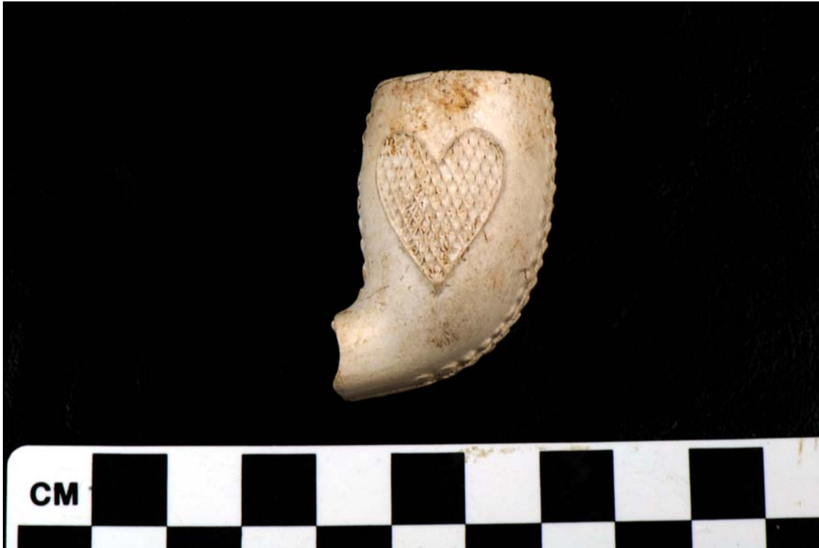
Figure 6. Photograph of Side B depicting a hatched heart on a molded decorated 19 th century pipe bowl recovered from STP 9.

STP 10 was placed 4 meters southeast of STP 9. Artifacts were only recovered from the first 10-centimeter level in STP 10. These artifacts consisted of a kaolin clay tobacco pipe stem, nails, brick and mortar, bottle glass, and brown lead glazed coarse earthenware.