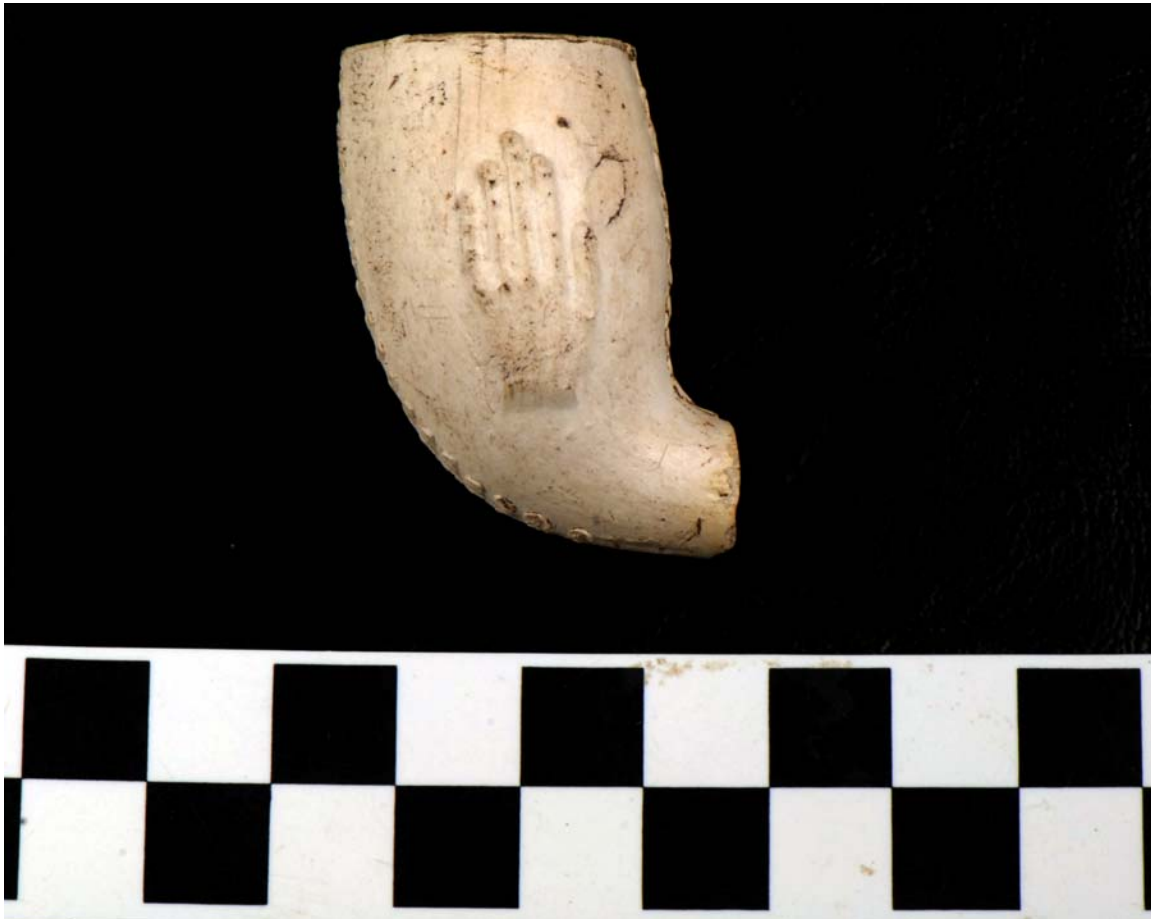
Figure 5. Photograph of Side A depicting a hand on a molded decorated 19 th century pipe bowl recovered from STP 9.

whiteware, annular whiteware, plain whiteware, and hand painted green whiteware. STP 8 was placed 6 meters southwest of STP 7 to continue testing the area east of the modern driveway. STP 8 yielded a hand built, prehistoric pot sherd, ferrous metal, bone, brick and mortar, bottle glass, plain whiteware, plain porcelain, lead glazed coarse earthenware, and hand painted blue on white porcelain. STP 9 was placed on the west side of the modern driveway 6 meters southeast of STP 1. STP 9 yielded brick, mortar, kaolin clay tobacco pipe stems, a button, a 19 th century molded decorated kaolin clay tobacco pipe bowl, ferrous metal, bottle glass, metal shoe rivets, hand painted polychrome pearlware, plain creamware, delft, plain porcelain, yellow slipware, plain whiteware, plain pearlware, and shells.