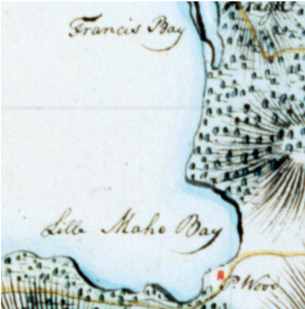
Figure 2. Oxholm's 1780 map depicting the Maho Estate

Oxholm's 1800 map of the island does not record an owner or plantation name. The historic structure that is on the edge of the road at the eastern end of the bay, just across the street from the proposed parking area appears in both of Oxholm's 1780 and 1800 maps of the island.